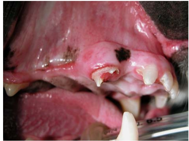
Photo showing the fractured canine tooth.

This dog was diagnosed with idiopathic root replacement resorption. Teeth 104, 107 and 406 required surgical extractions. The multiple other teeth that showed various stages of root resorption were not extracted. As long as the lesions are not exposed to the oral cavity, they are asymptomatic and do not require treatment. Teeth undergoing resorption are usually very difficult to extract. An oral examination and radiographs are recommended every 6-9 months.