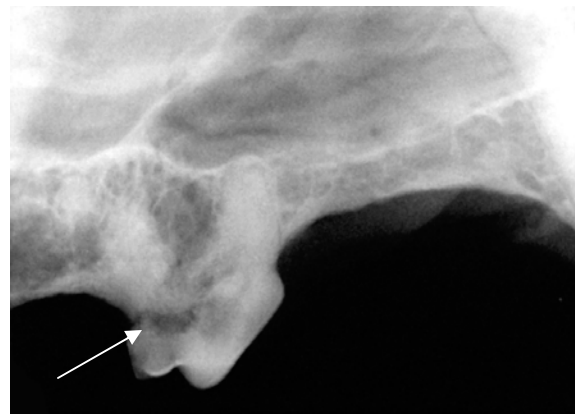
Severe resorption of the maxillary right 3rd premolar.