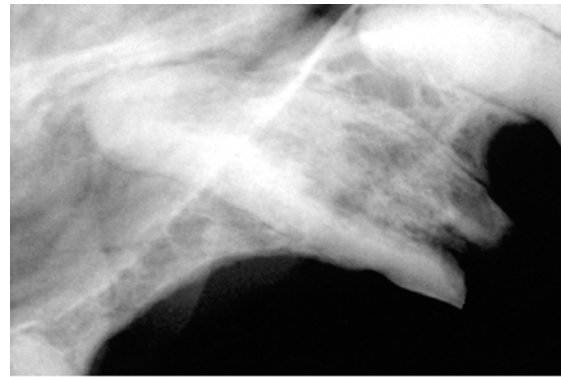
Radiograph showing the severe resorption of the canine tooth.