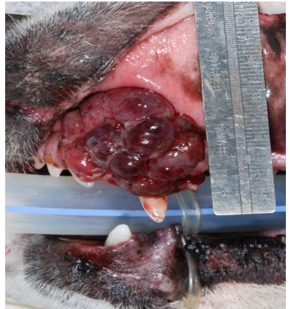
Lateral view of the maxillary mass.