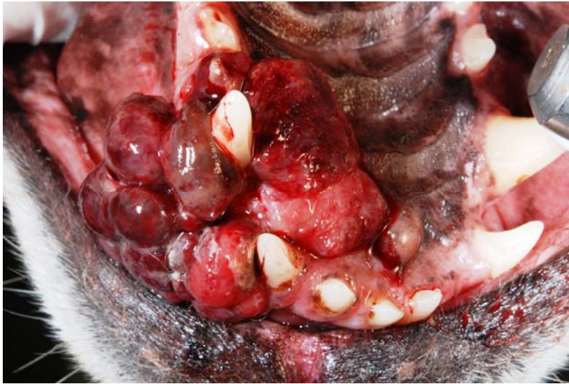
Ventral view of the hard palate showing a large mass around the left canine tooth.