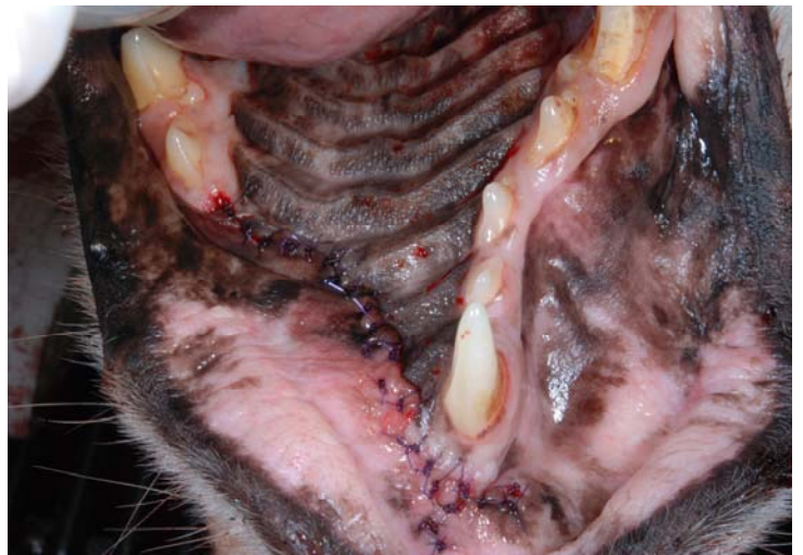
A rostral maxillectomy was performed to excise the mass. The diagnosis was an osteosarcoma and the margins were clean.