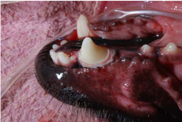
The tooth was prepped for a Bruxzir™ crown.