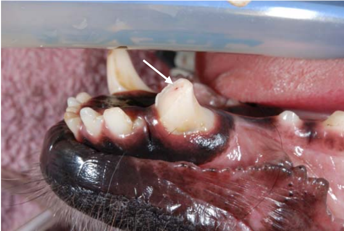
A complicated crown-root fracture was found at the left mandibular canine tooth.