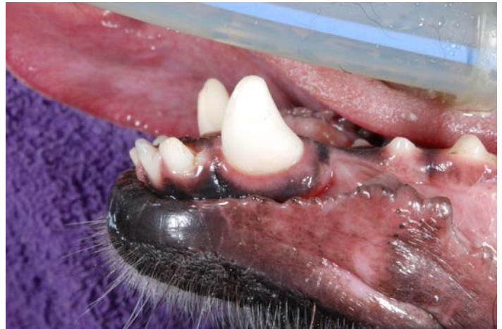
The Bruxzir™ crown was cemented to the tooth.

Some clients will decline metal crown therapy for esthetic reasons. Tooth-colored porcelain has been an option, but it can easily be chipped or cracked. Bruxzir™ crowns are made from medical-grade zirconia. The material is virtually unbreakable and biocompatible and can be made to match the color of the existing teeth. The company claims that it can be used on 4th premolars and military/police dogs.